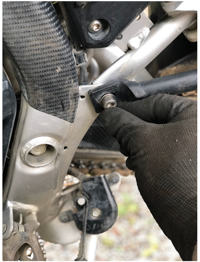
Torque Spec: 23Nm/17lbs