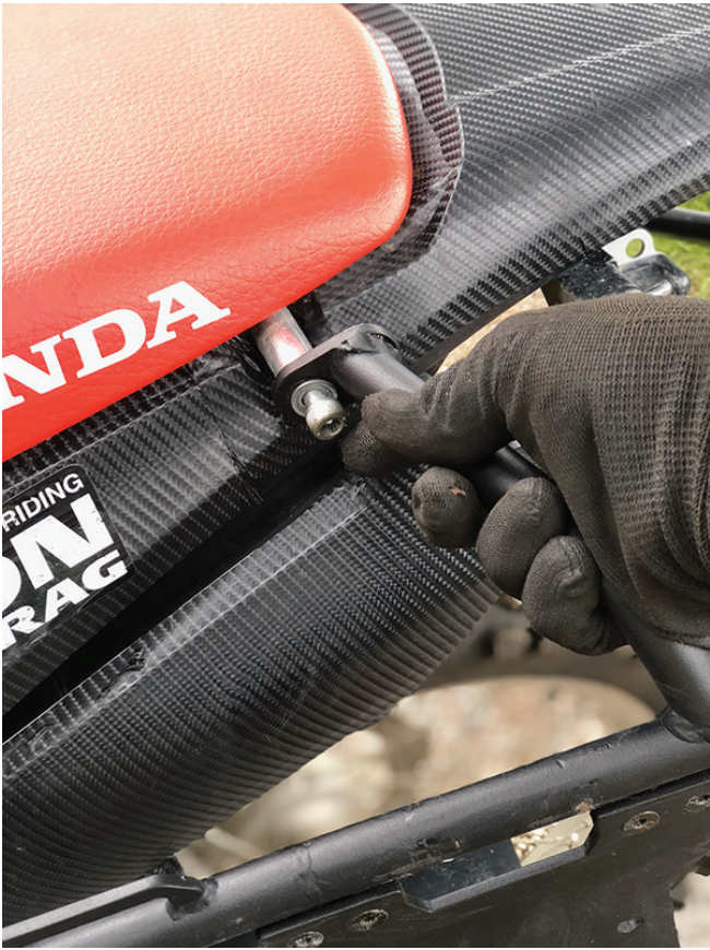
Torque Spec: 23Nm/17lbs